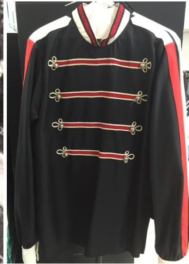
Outdoor performance, 1952 [Belts, white trousers] Drum-Major uniform from 1970s/80s