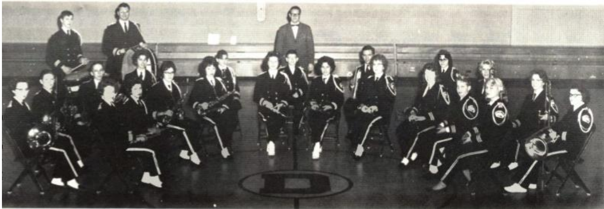
In concert, 1959 [Stripes, spats, citation cord, shoulder patch]