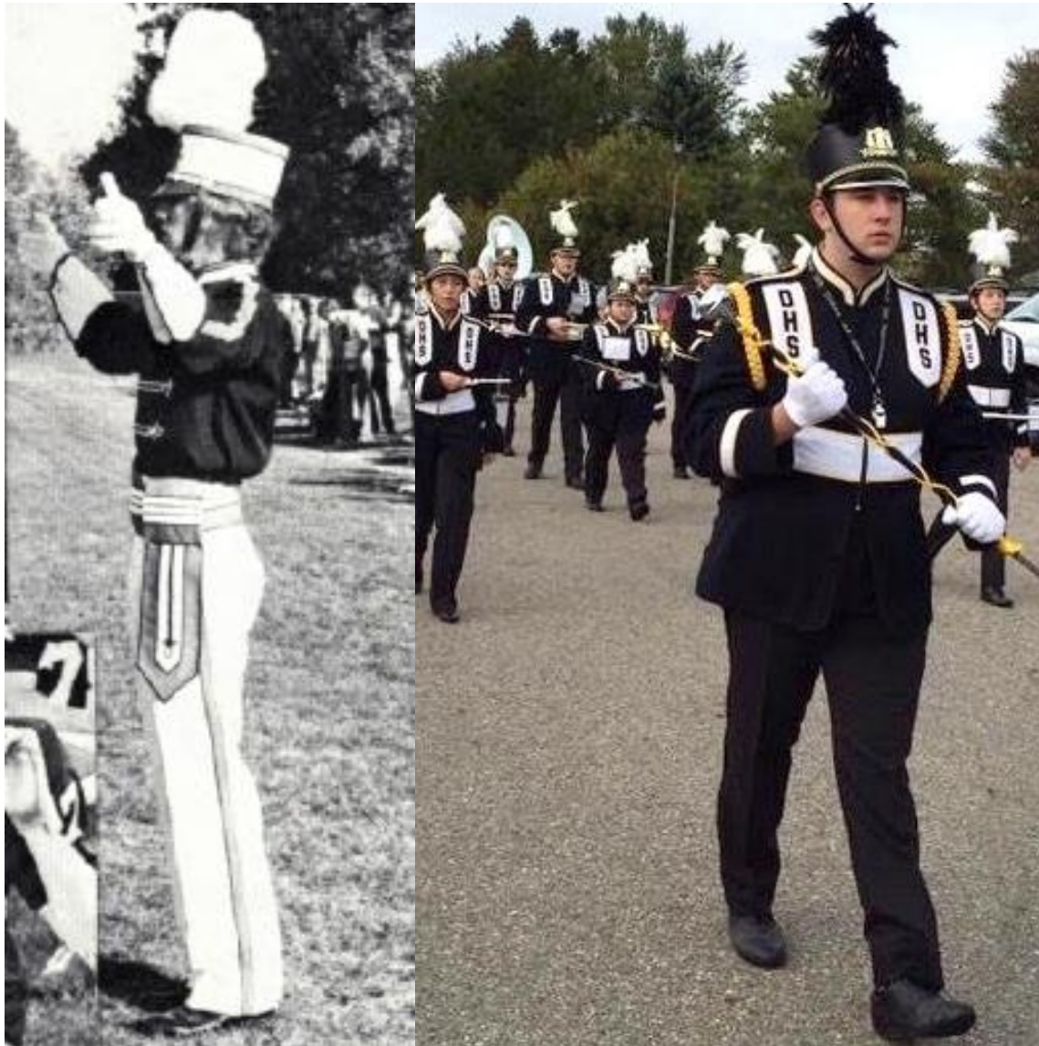
Aggie Drum-Majors: 1985 (left) [Contrasting trousers, "belt," cadet stripes] 2015 (right) [Shako hat, "belt," shoulder cords, wordmark]